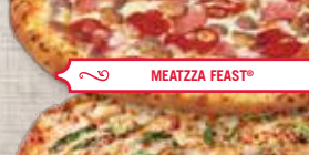
SPINACH & FETA