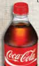
Ice Cold Coca-Cola®