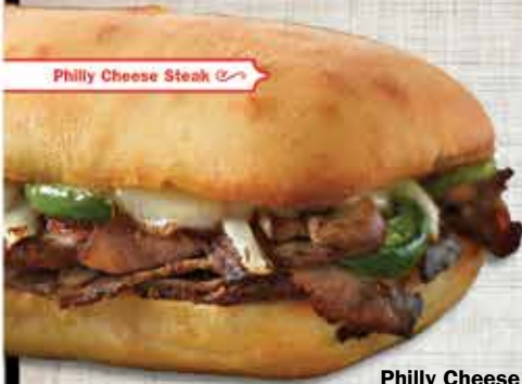
Philly Cheese Steak

ALL SANDWICHES ARE PREPARED ON ARTISAN BREAD AND BAKED TO A GOLDEN BROWN.