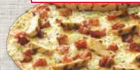
CALI CHICKEN BACON RANCH™